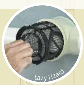
The mesh filter is easily accessed via a transparent, screw-on cover & is simply cleaned in water