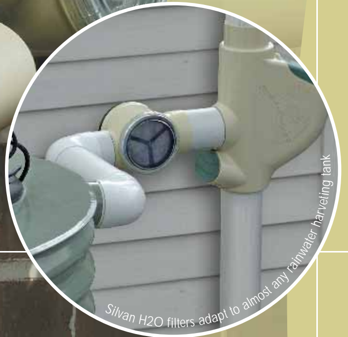
Silvan H2O filters adapt to almost any rainwater harvesting tank