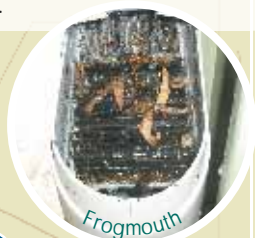
A Leaves & other debris from the roof are diverted to the storm water via the mesh & unique roller system