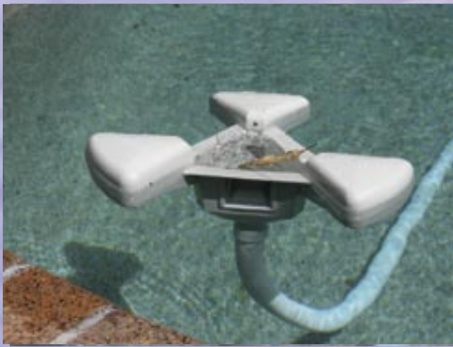
Dragonfly The ultimate pool cleaner